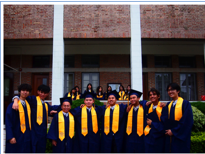
Class of 2025