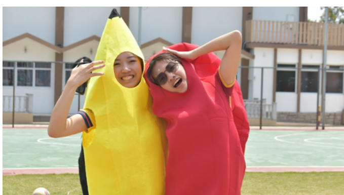
Our Stars Of The Day Chilli For Red Team, Banana for Yellow Team