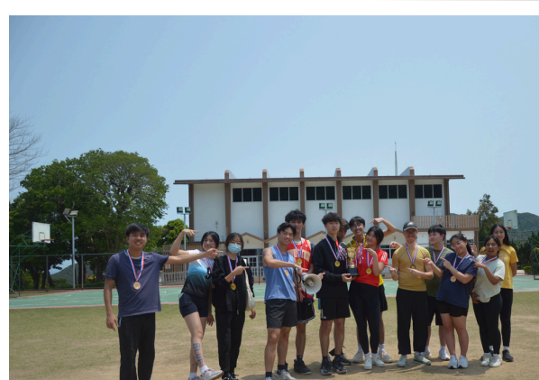
Last Sports Day For 2025 Seniors