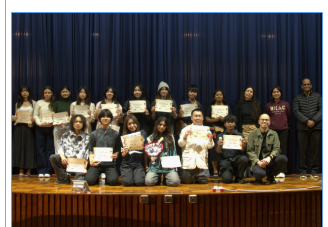
The participants of the HKAA talent show

On March 29, students witnessed HKAA Got Talent in the gym. This phenomenal event enabled certain students to showcase their talents and others to view and enjoy them. Intricately planned by our Student Association, HKAA Got Talent helped foster a more connected, engaging school community, ultimately creating a warmer student environment.